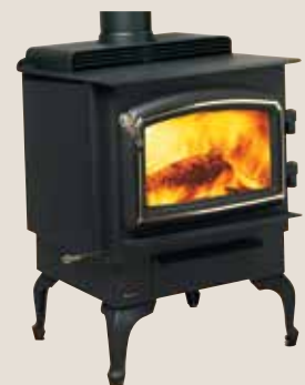
Vancouver with cast legs and optional gold trim door & optional airmate

Wood burning tip #4 Burn small, hot fires. A smouldering fire creates more smoke, and smoke equals creosote build-up.